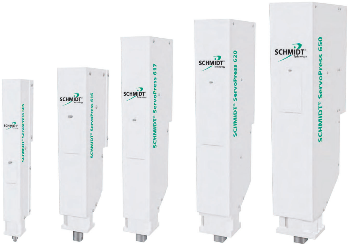
Press type 605